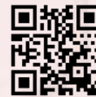
Supported Decision Making