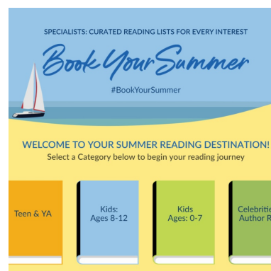
Barnes & Noble