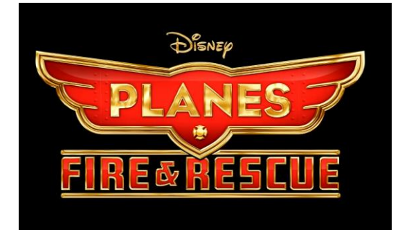
Rated PG. 83 minutes. Tuesday, August 19th at 6:30 pm Price: $5.00 each ticket.

Jordan Landing Cinemark Theater presents a special showing: